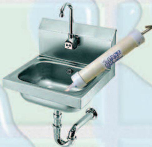
Sinks, Labs & P-Traps